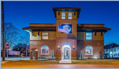
THE HISTORIC GAINESVILLE FIREHOUSE - 2018